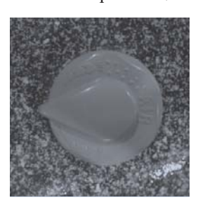
Air Control Valve

4. AIR CONTROL VALVES - These are located around the top of your swim spa. You may increase or decrease the force of your jets by opening or closing the air control valves. Typically, one dial controls the air to water ratio and mix to one group of jets. When not in use the air controls should be kept in the closed position, as air bubbles tend to cool the water.