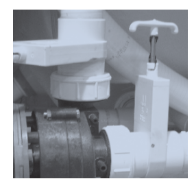
Slice Valve and Pump Union

3.) Be sure all pump and heater unions are secure. Each pump has 2 unions and the heater has 2 unions. A newly delivered swim spa may have loose unions caused in transporting the swim spa. Check that all slice valves are open, in the up position. Again, the slice valves may become closed during trans portation of the swim spa.