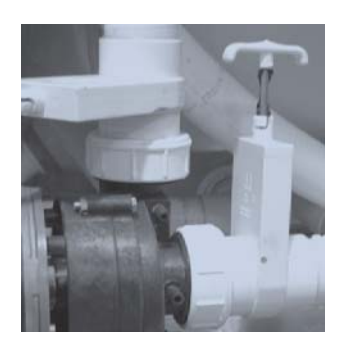
Slice Valve and Pump Union